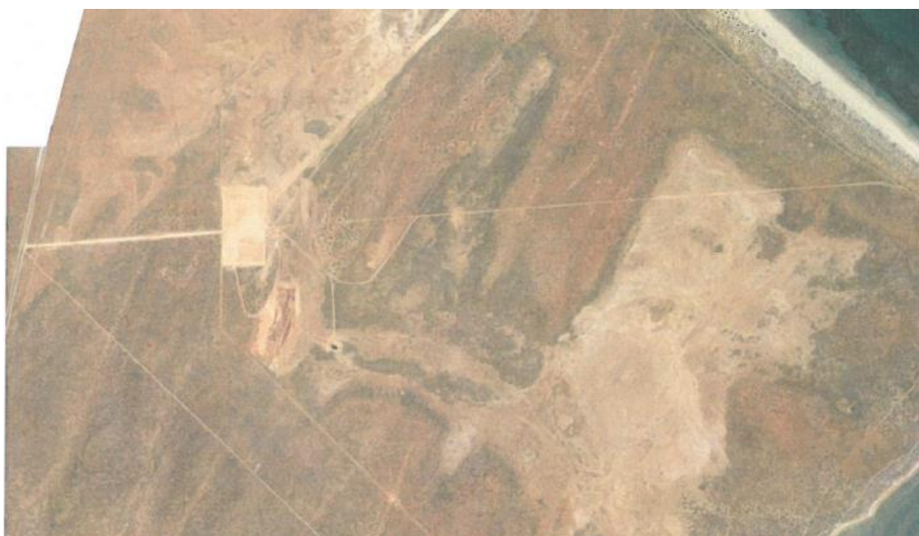
Figure 3 – Existing tracks through the wetland area