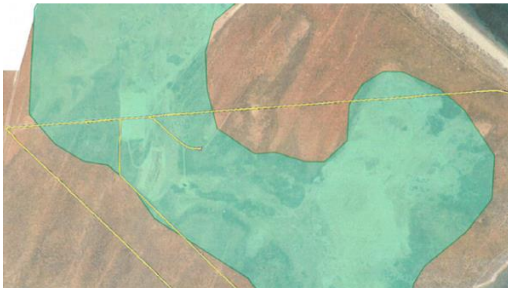
Figure 2 – Wetland area (green) and application area (yellow)

In relation to the appellant's concerns in relation clearing principle (b), DWER advised that five of the nine identified fauna species are marine based or only found in the Northern Territory and thus were not discussed further. In regard to the curlew sandpiper, great knot and eastern curlew of which suitable habitat may occur within the wetland area, DWER noted that the wetland has been historically cleared and considered that the application area itself is not likely to contain significant habitat for these species as it follows well-worn tracks as shown in Figures 2 and 3. As the black-flanked rock-wallaby is a highly mobile species and the local area retains extensive vegetation in a better condition, DWER considered that the degraded vegetation within the application area is unlikely to contain significant habitat for this species.